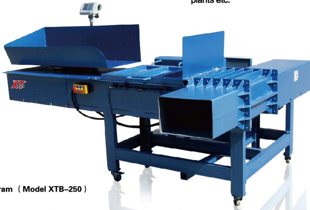
Diagram ( Model XTB-250 )

Specialized designed for baling and bagging wood shavings/chips, alfalfa, waste fabric, cotton yarn and textile scraps etc. Widely used by laboratories, the pets bedding materials plants, clothes recycling plants etc.